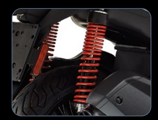
RED SHOCK ABSORBERS SPRINGS

A winning mix of engine power, agile design and hi-tech features, MP3 300 hpe Sport will win you over with its personalisations: the wave front brake disc, which comes as a standard equipment, and the red details, as the shock absorber springs, in contrast with the sporty matt black trim. The Piaggio MIA multimedia platform, standard equipment on the Sport version, connects your smartphone to the vehicle's electronic system, transforming it into a full-fledged on-board computer to keep you connected, plan routes and view performance and general vehicle status information.