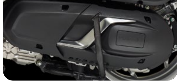
LED DRL NEW 400 HPE ENGINE

The single-cylinder, four-stroke and four-valve 400 hpe engine with liquid cooling and electronic injection is considered to be one of the best in its category. Piaggio technical research focused on mechanical and thermodynamic performance, reducing the vibration and noise level. Its motorcycling heritage shines through in a few choices such as the automatic multi plate wet clutch, which ensures an extraordinary riding experience even in conditions of thermal stress and consistent performance over time.