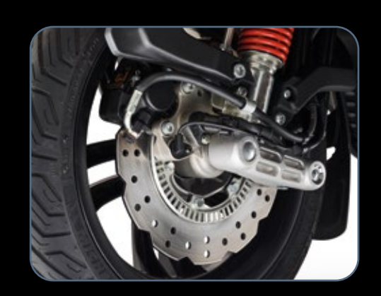
WAVE BRAKE DISCS